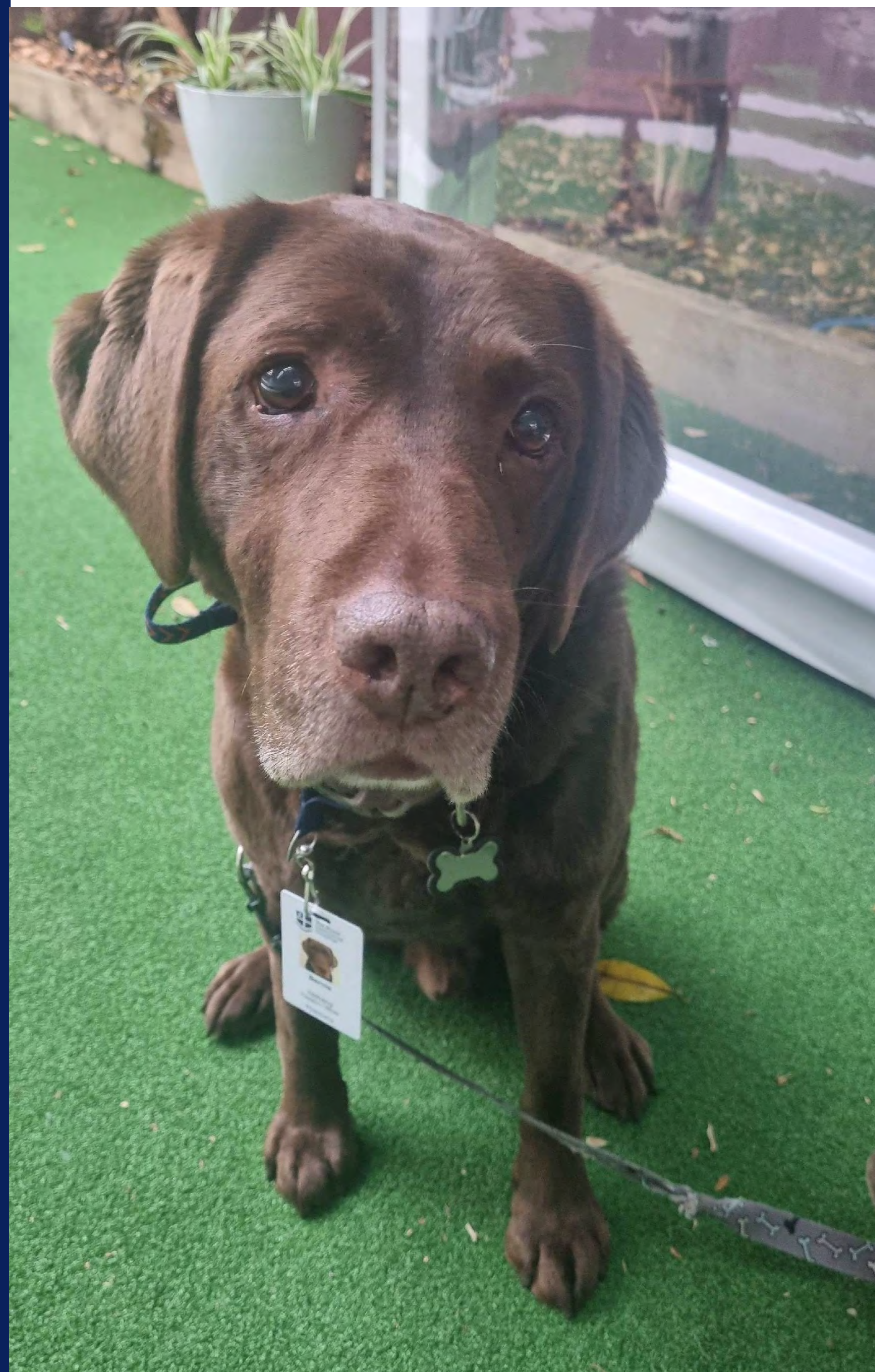
Figure 1. Bernie, RMH Pharmacy Wellbeing Pawject Officer (staff pet dog)