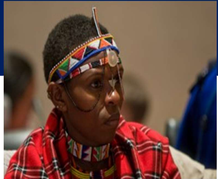
Figure 1. Health | United Nations For Indigenous Peoples