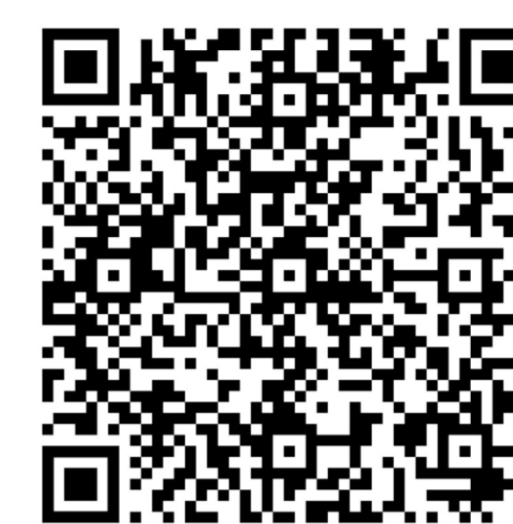
Comparison of VAD Legislation across Australia

Voluntary Assisted Dying (VAD) is now legislated in all states in Australia. Each state has legislation that differs, but each state has a centralised pharmacy service that is responsible for VAD medication management, storage and education and operates statewide.